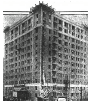
Huntington Hotel, under construction, December 1923