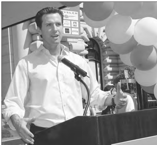
Mayor Gavin Newsom