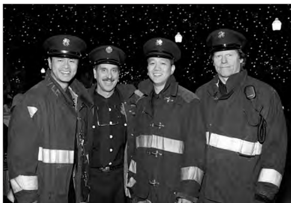
SFFD's “finest” Firefighters