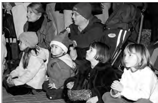
Future NHA members enjoying the “Magic of the Music”