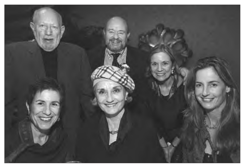
The gang's all here!