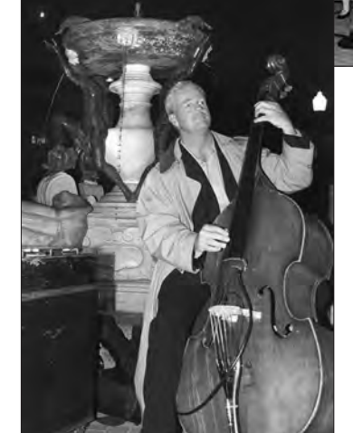
A Holiday Tradition