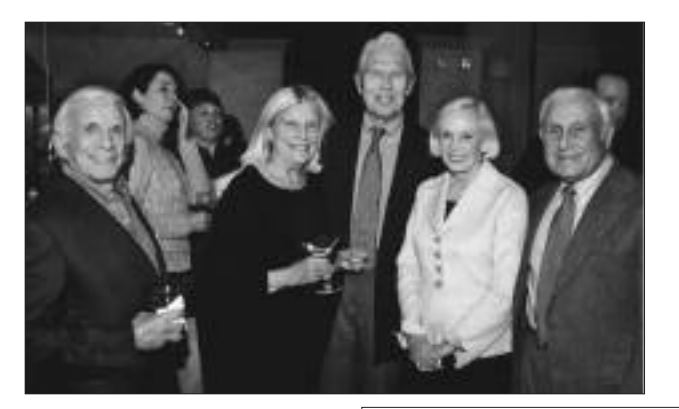
Members enjoying an evening of great food