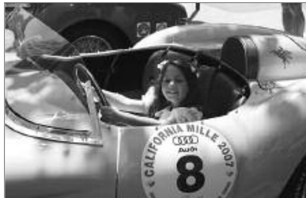
Future Mille Driver!