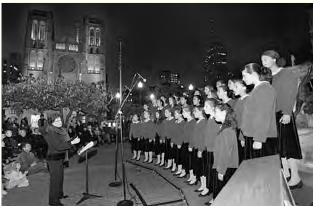
SF Girls Chorus were invited to perform at the inauguration of our 44th President Barak Obama