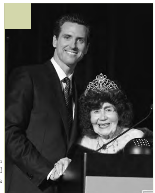
Mayor Gavin Newsom and Dame Bella