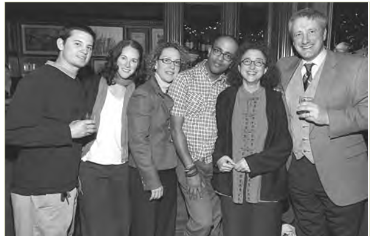
Revelers at the Big Four before the tree lighting