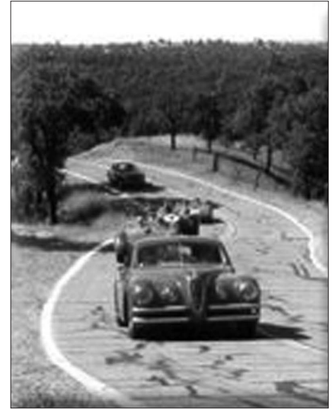
April 25 ~ 1 to 4 p.m.

Patterned after the world-famous Italian Mille Miglia, The California Mille is a four-day, 1000-mile tour through Northern California. The California Mille unites cars and drivers from around the globe.