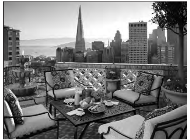
City view from the Penthouse Terrace