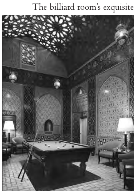
The billiard room

During its current renovation, carpeting covering the room's concrete floor was removed, revealing remnants of a hole indicating prior existence of a fountain in the area now occupied by the billiard table. The cement floor was cleaned and faux painted to match the Moorish walls. Rumors have it that the room was also once used as a prayer chamber, and if one listens quietly, muffled murmurs of veneration can sometimes still be heard, if only in the imagination.